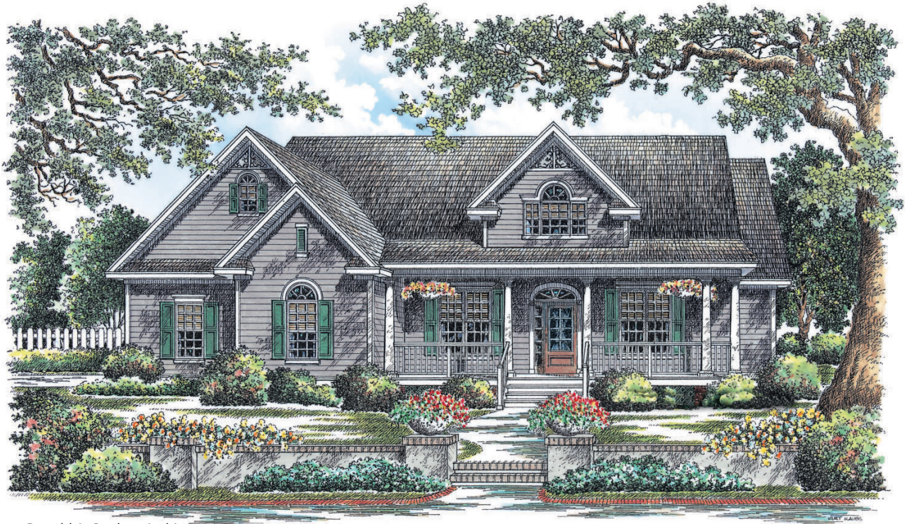
© Donald A. Gardner Architects, Inc.